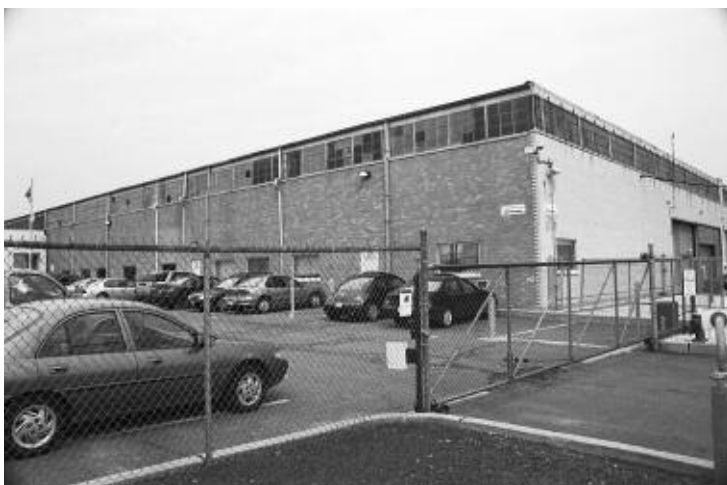
Elizabeth Detention Center, Elizabeth, NJ.

© June 2003, Physicians for Human Rights and the Bellevue/NYU Program for Survivors of Torture. Boston and New York City. All rights reserved.